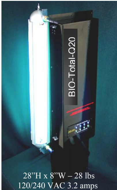
28"H x 8"W – 28 lbs 120/240 VAC 3.2 amps